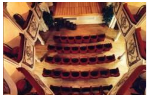
Stalls and view from the second box order of the Teatro della Concordia of Monte Castello di Vibio